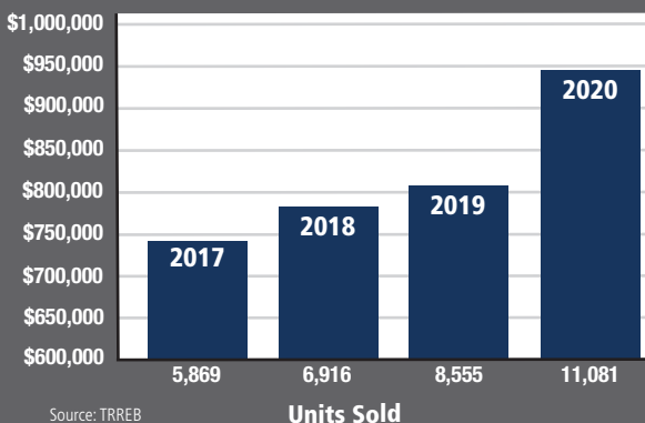
Average Home Prices - July in the Greater Toronto Area

professor at Ted Rogers School of Management, specializing in the impact of Covid-19 on the economy, is one of them: "I was surprised at how the housing market responded to the pandemic. In March and April, I was very pessimistic and thought the market would correct. But, surprisingly, it's been resilient. I think Covid-19 created a lot of confusion in people's minds. They thought it was going to cause a huge economic catastrophe and a lot of people were going to lose jobs. People did lose jobs, but mainly, those were in lower-income positions. The fallout has not really impacted the high-skill labour sectors, like finance and technology. Thus, the market has been able to stave off a potential sell-off and homeowners have been able to hold on to their real estate assets." REU